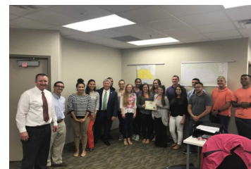
Crime Strategies Unit