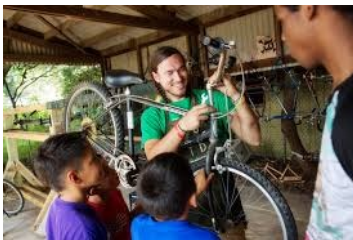
Front Yard Bikes