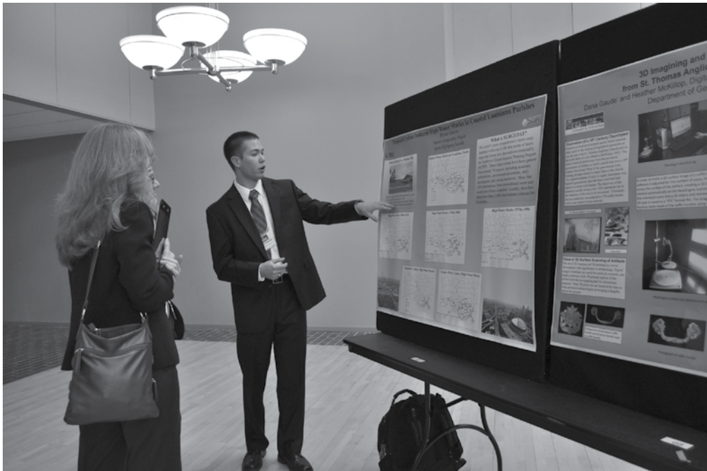
LSU Discover Day 2014